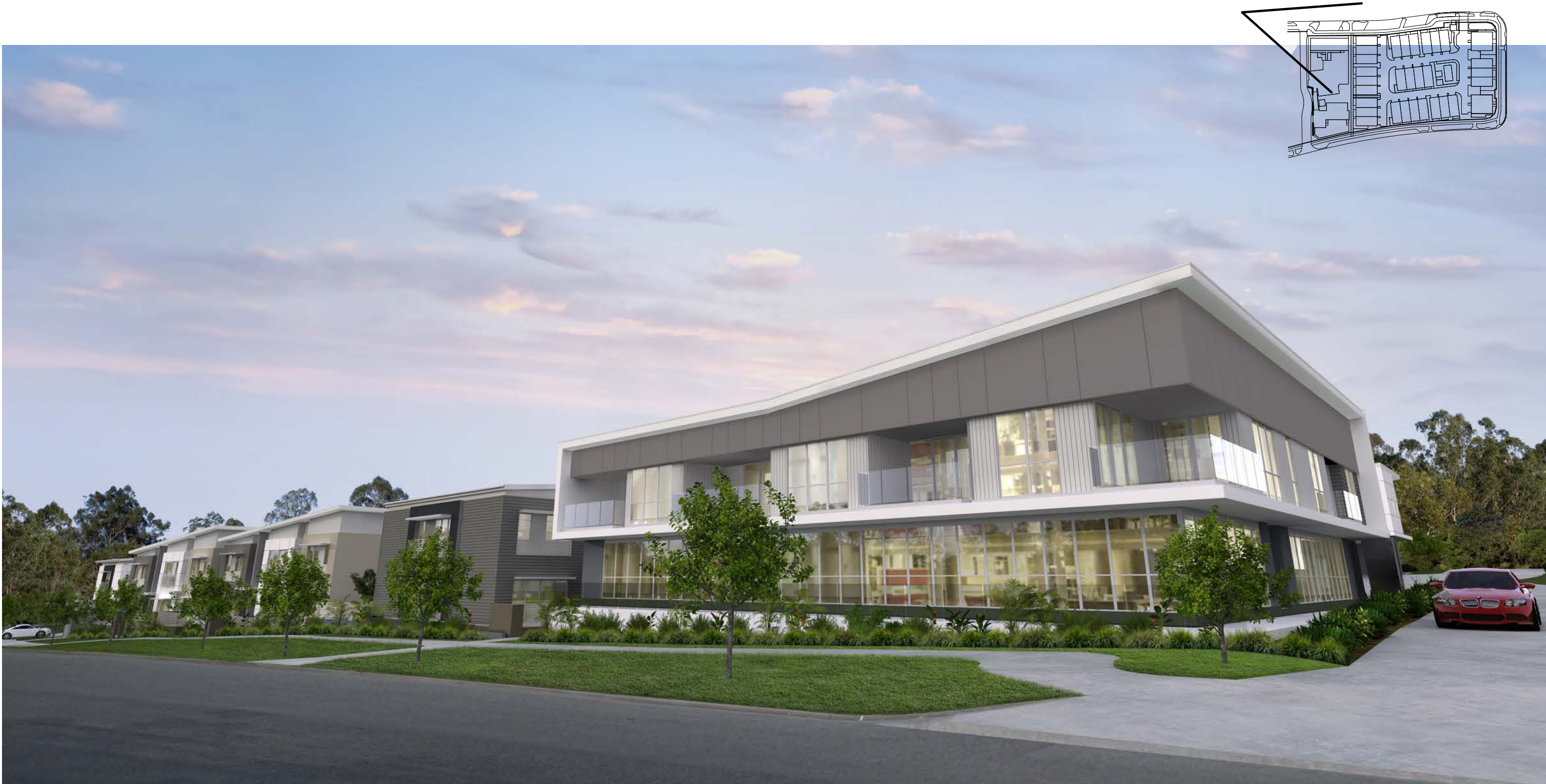
PERSPECTIVE VIEW 4