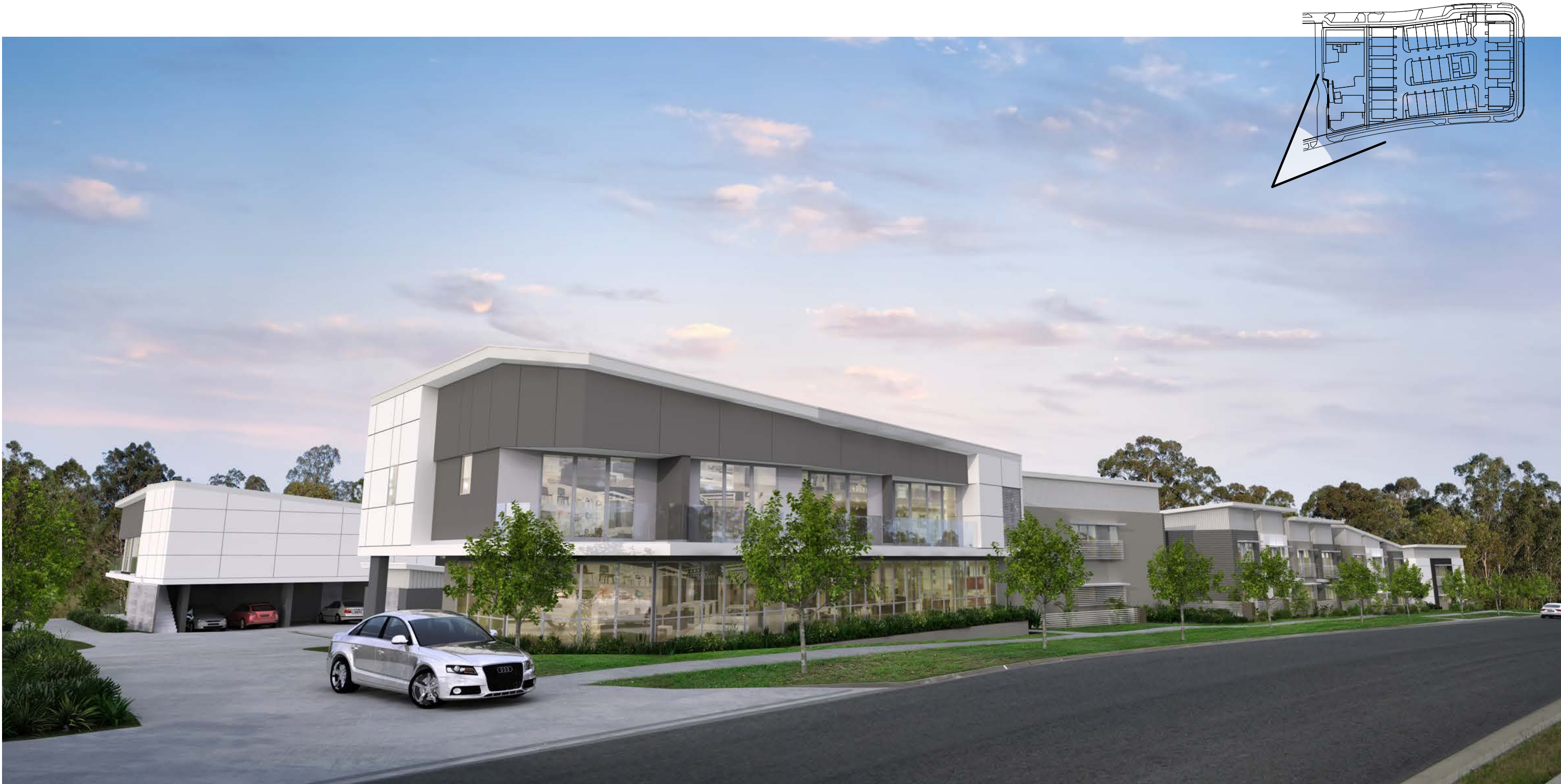
PERSPECTIVE VIEW 3