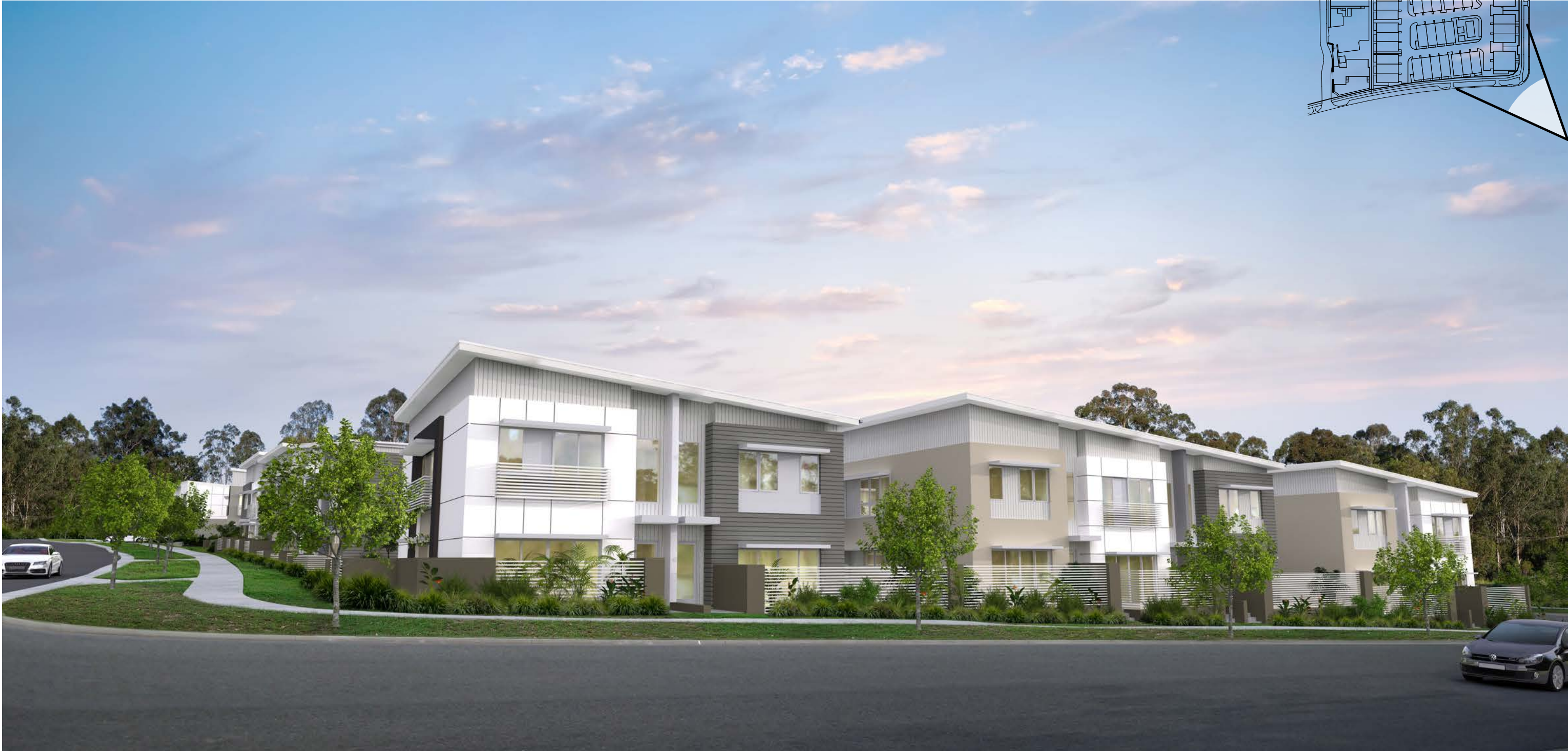
PERSPECTIVE VIEW 2