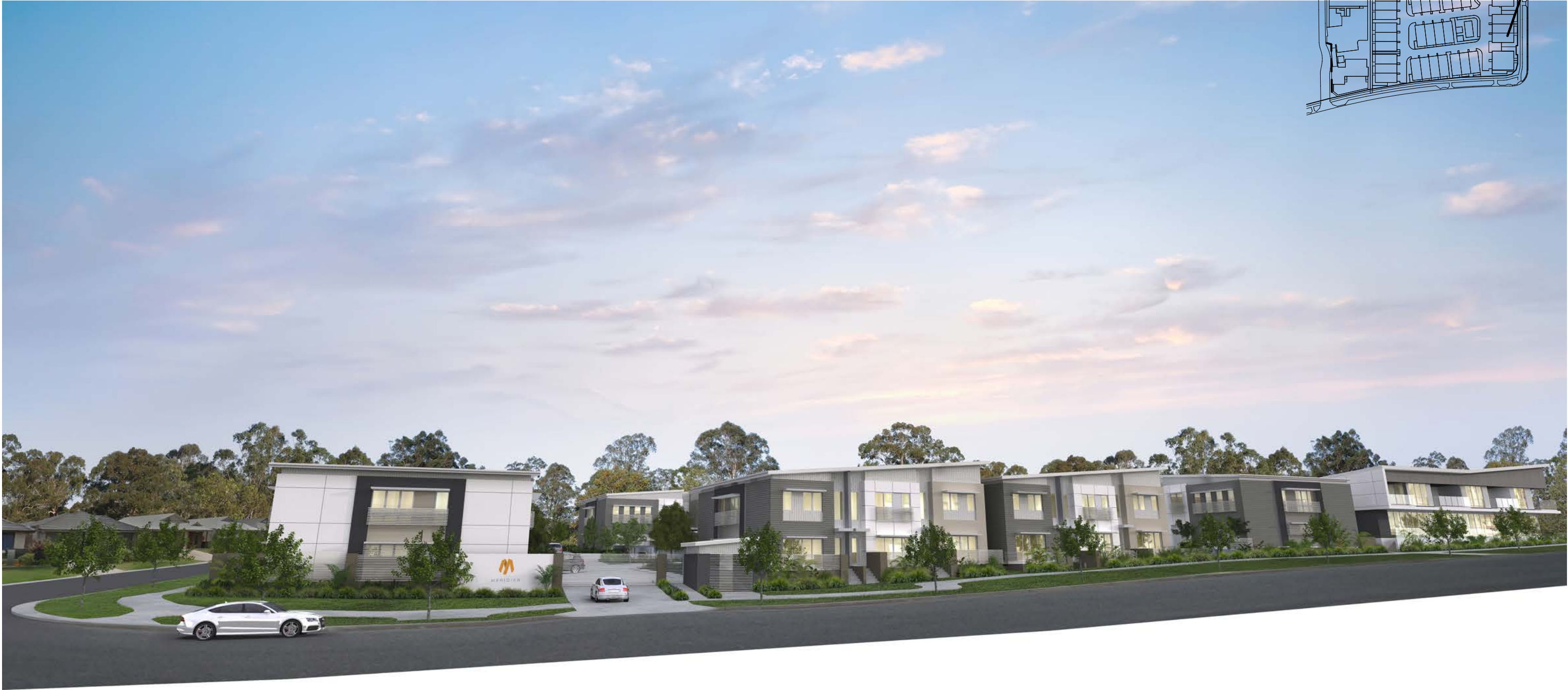
PERSPECTIVE VIEW 1